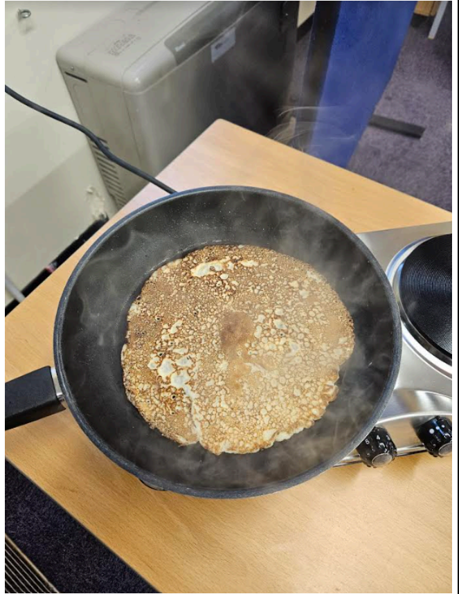
Class News and other bits